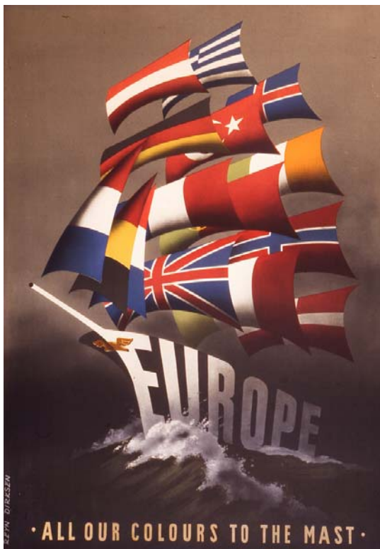
Image 1: 1950 Marshall Plan Poster Contest Winner, by Reyn Dirksen 7