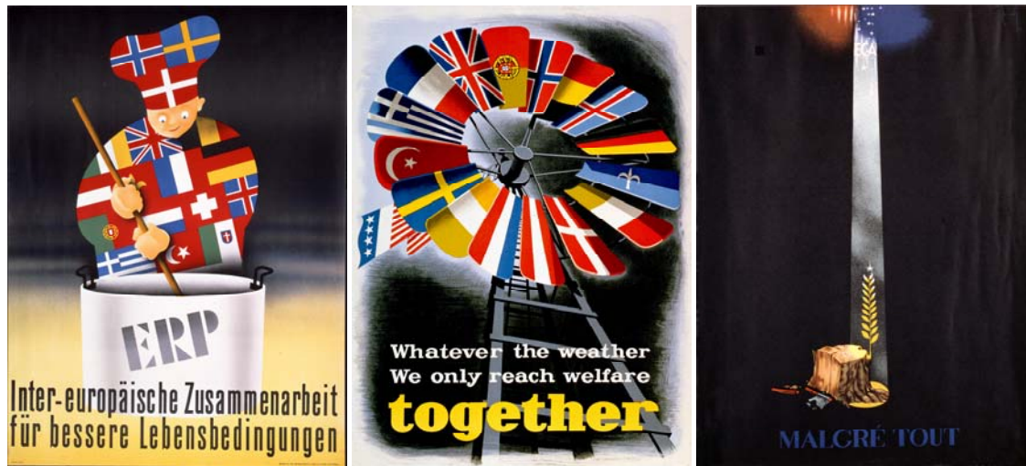
Image 3 to 5: Marshall Plan Posters, 1950: Fourth and Fifth Prize Winners 16

gan "You hold the key" and shows a giant key inscribed with sheaves of wheat, its blade lined with European flags, and "ERP" in large red letters in the middle of the key ring. In a Swedish poster, a pair of red, white and blue pruning shears labeled "Marshall Aid" lie across a strand of barbed wire; in an Austrian contribution, a broken off tree with an American flag near its roots sprouts new growth and doves build a nest of European flags; another Dutch artist portrayed a windmill with many blades comprised of European flags, and the American flag as rudder; and in a poster by a Turkish artist, an ethereal celestial body comprised of American stars and stripes beams a shaft of light down on a dead tree stump, and a sheaf of wheat sprouts out the side (see illustrations).