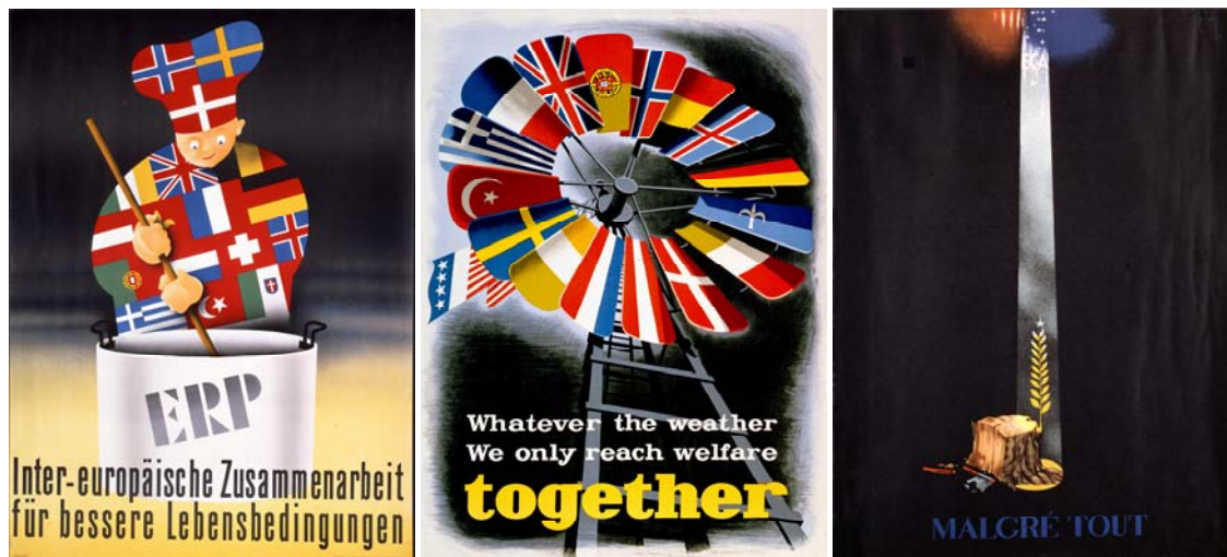
Image 3 to 5: Marshall Plan Posters, 1950: Fourth and Fifth Prize Winners 16

gan "You hold the key" and shows a giant key inscribed with sheaves of wheat, its blade lined with European flags, and "ERP" in large red letters in the middle of the key ring. In a Swedish poster, a pair of red, white and blue pruning shears labeled "Marshall Aid" lie across a strand of barbed wire; in an Austrian contribution, a broken off tree with an American flag near its roots sprouts new growth and doves build a nest of European flags; another Dutch artist portrayed a windmill with many blades comprised of European flags, and the American flag as rudder; and in a poster by a Turkish artist, an ethereal celestial body comprised of American stars and stripes beams a shaft of light down on a dead tree stump, and a sheaf of wheat sprouts out the side (see illustrations).